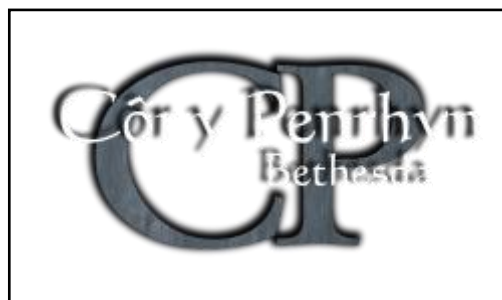
Figure 2 Bethesda Male Voice Choir Logo