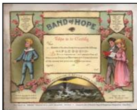
Figure 5 Band of Hope Outing in Eastleigh 20 and Certificate