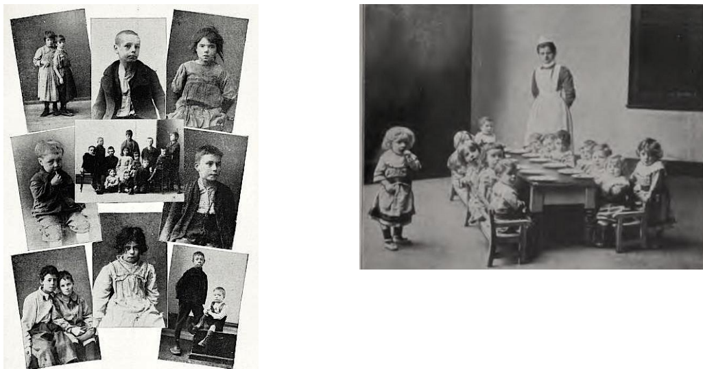
Figure 1 Dr Barnardo's Children