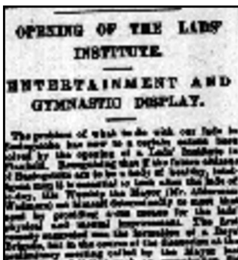
Figure 3 Extract from Newspaper Report of the Opening of the Lad's Institute

prevent serious accident. Parallel bars and a vaulting horse with a springboard were also to be seen. Adjoining this main room ... [was] a small room in which boys of quieter tastes ... [could] indulge in reading and in games of skill, such as draughts and chess. 9